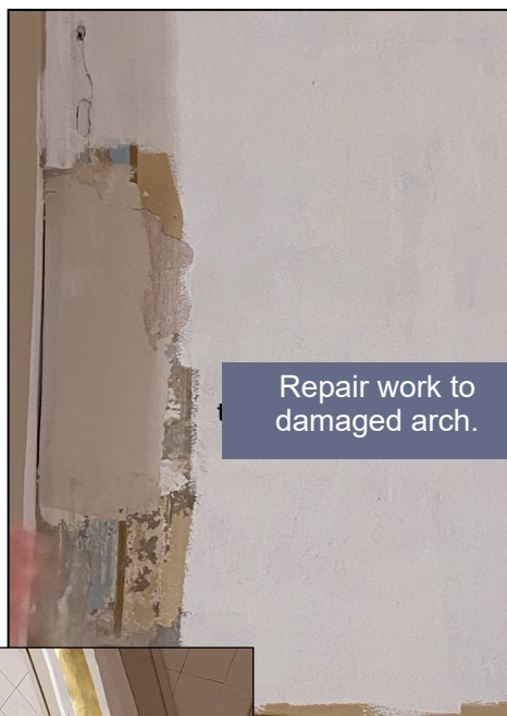
Repair work to damaged arch.

The painting of the ceiling tiles in nave is complete. The murals have been cleaned and the trim around them painted. Gold paint has been applied to the ribs and application of the rib stenciling has begun.