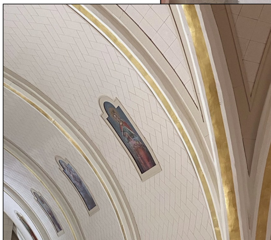
Ceiling in nave completed. Trim around murals completed. Gold paint applied to ribs of nave.

THANK YOU to all for your continued support of the St. Mary of Mount Carmel restoration project!!!